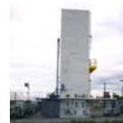
ASU process control