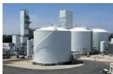
Bulk Gas Monitoring