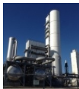
HyCO & SMR Process Control