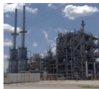
HP Gas Analysis in Hazardous Locations