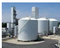
Bulk Gas Monitoring