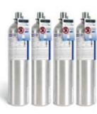
Specialty Gas Monitoring