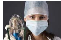
Quality Control for Medical Gases