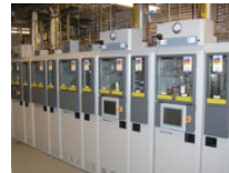
Analyzers for turn-key systems