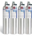
Specialty Gas Monitoring