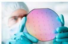
Gallium Nitride (GaN)