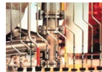
High Purity Piping Qualification