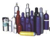
QC for HP Gases & Mixtures