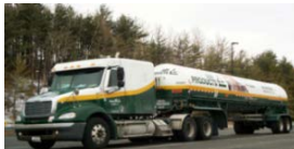
Truck fill Measurements