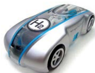
Fuel Cell Hydrogen