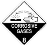
Corrosive Gas Monitoring