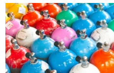
Specialty Gas Monitoring