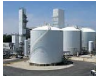
Bulk Gas Monitoring for Semiconductor