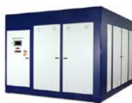
Pre- & Post-Purifier Monitoring