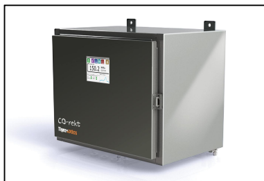
Tiger Optics CO-rekt analyzer

Tiger's CO-rekt™ analyzers have proven highly beneficial in HyCO and, similarly, SMR (Steam Methane Reformer) processes for analysis of CO and other contaminants in petrochemical feedstock. That's because our CW-CRDS (Continuous Wave Cavity Ring-down Spectroscopy) technology is ideally suited for process monitoring, where performance factors, like robustness, uptime, throughput, low maintenance and ease of use are at a premium. Indeed, one user, who has deployed our CO-reakts widely, calculates a 13-month payback on investment.