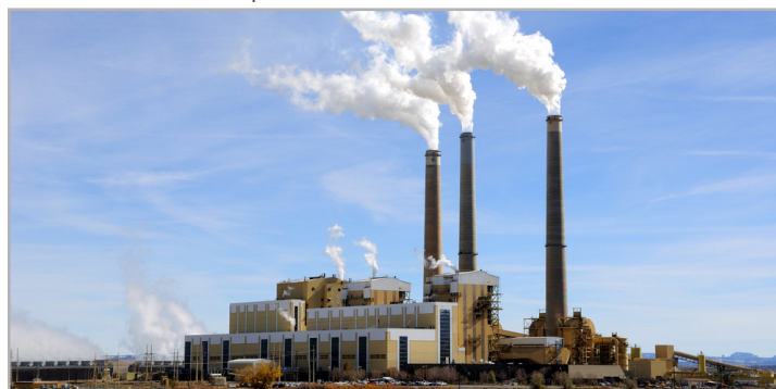
Fig. 2 Coal-fired power plant

described above. These emissions limits require HCl emitters to monitor and report the level of the gas present in stack emissions and to ensure that steps are taken to guarantee that emissions fall below the specified limits. This may require the emitter to either refine their process, via the use of cleaner fuels, for example, or to add abatement technology downstream of the process to reduce emissions of HCl.