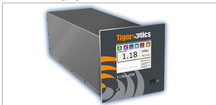
Fig. 1 T-I Max CEM HCl analyzer

HCl is generated by multiple industrial processes, with combustion of coal and oil for household and industrial power generation as the primary source. Here, chlorides present in the fuel are converted to HCl in the combustion process and emitted with other by-products. In addition, industrial processes emit HCl as a result of chlorides present in raw materials that are converted to HCl during production. In cement production, for instance, raw materials, including calcium carbonate, silica, clays, and ferrous oxides, all contain chlorides, resulting in generation of HCl.